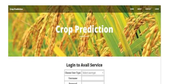
Fig -5.1: Login Page

The proposed system takes into consideration the data related to soil, and past year production and suggests which are the best profitable crops which can be cultivated in the appropriate environmental condition. As the system lists out all possible crops, it helps the farmer in decision making of which crop to cultivate.