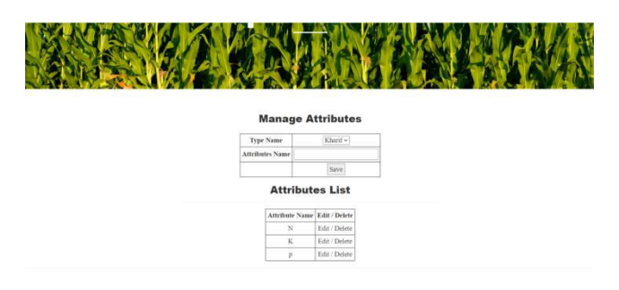
Fig -5.4: Manage Attributes Page

Snapshot 5.3 describes the Manage Types page, it s the functionality done by Admin to add the crop type. Basically we have gathered two types of crops that isKhariff and Rabi, under those types there are many crops available. Crops are divided according to their weather condition, location, requirements.